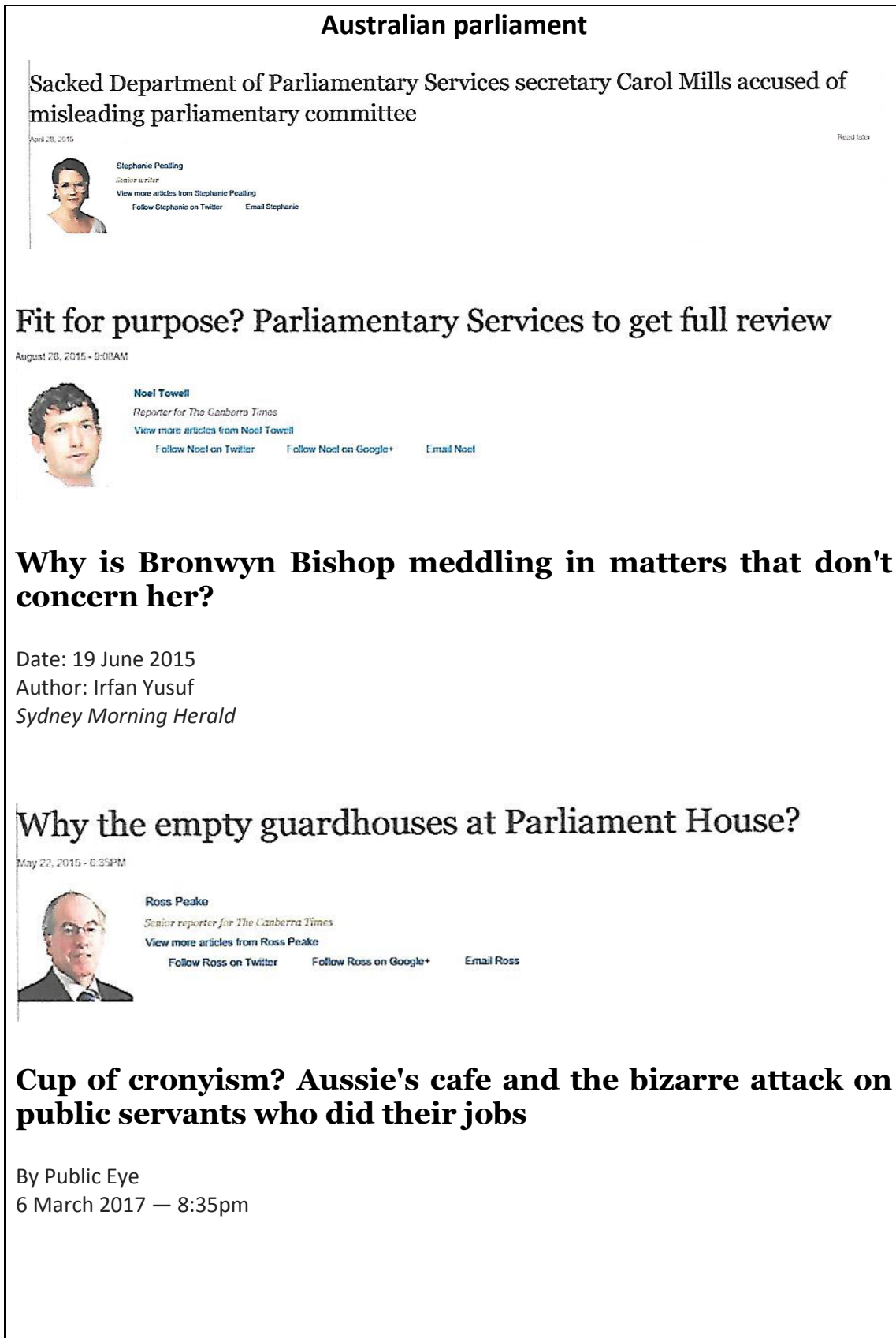
Figure 6-1 Sample of newspaper headlines in the Australian parliament during study period